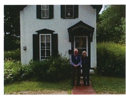
Stratton House 2022