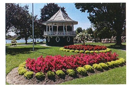
Couching Beach Park

In the twilight of our years, memories, held dear to our hearts, begin to fade. A memorable trip, one which we may not make again.