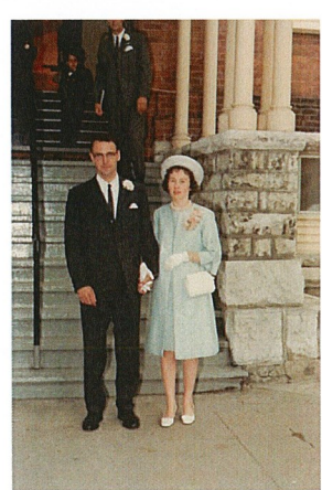
June 15, 1968,